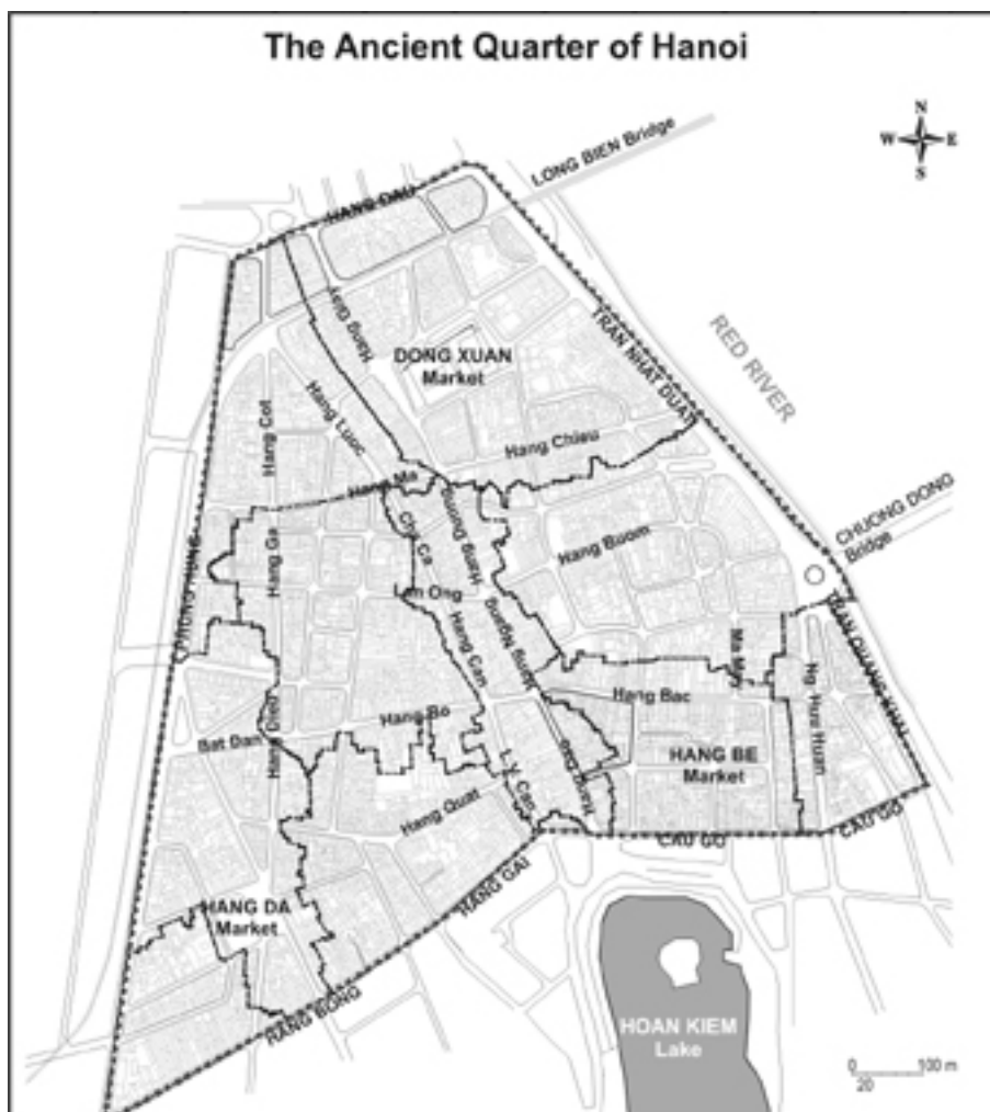
Fig. 5: Administrative boundaries of the Ancient Quarter, approved in 1997

Source: M. Waibel; Base Map: Ng. Vu Phuong 2001.