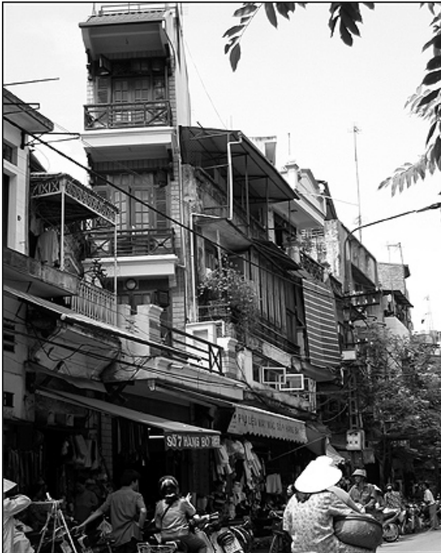
Fig. 4: Newly erected buildings in the Ancient Quarter of Hanoi, Hang Bo Street