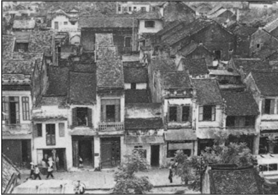
Fig. 2: The Ancient Quarter during the phase of state economic planning and administration