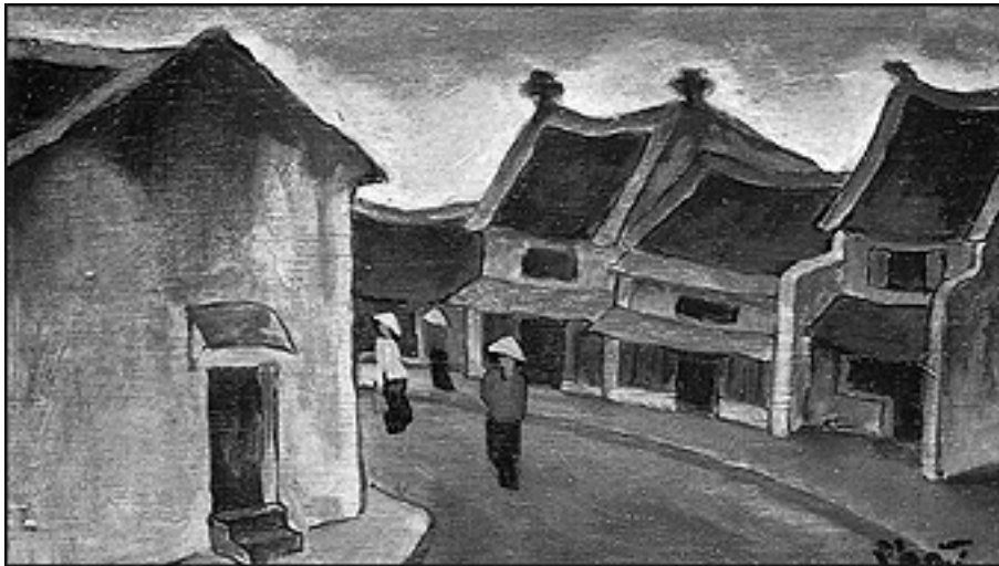
Fig. 3: The Ancient Quarter as seen in a painting by Bui Xuan Phai

Source: Bui Xuan Phai 1973, 20.5 x 35.5 cm.